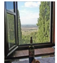
Villa Bedroom Window

Students are responsible for purchasing and arranging their own air travel. All students must arrive at Rome (FCO) Airport no later than 12:00 noon, Thursday, May 26, 2011.